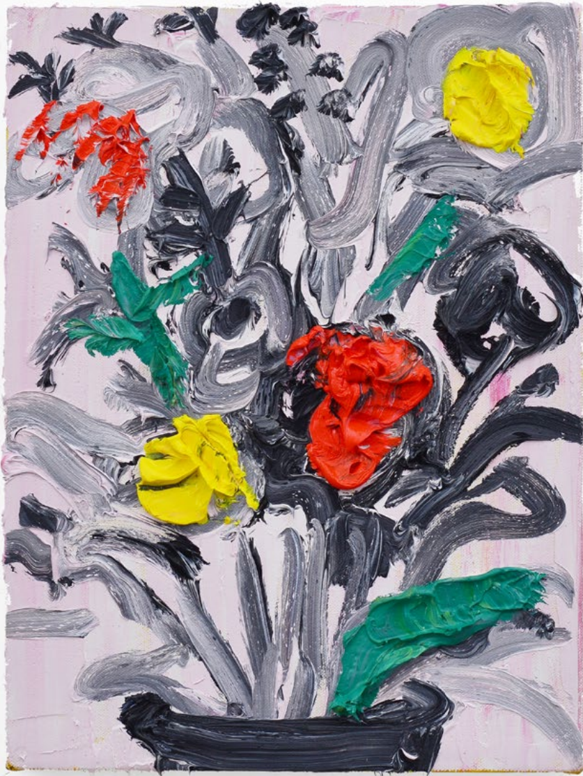
Georgina Gratrix Arrangement 2018 Oil on Canvas 40 x 30 cm