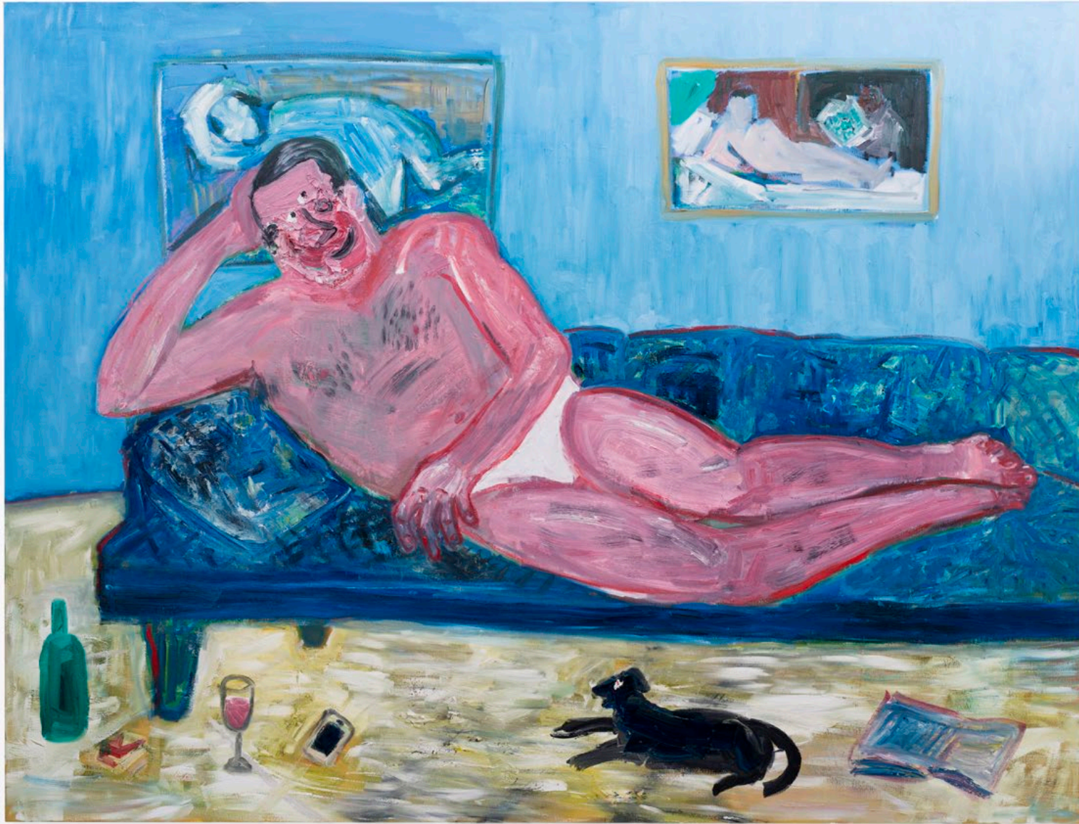
Georgina Gratrix Muse 2018 Oil on Canvas 190 x 250 cm