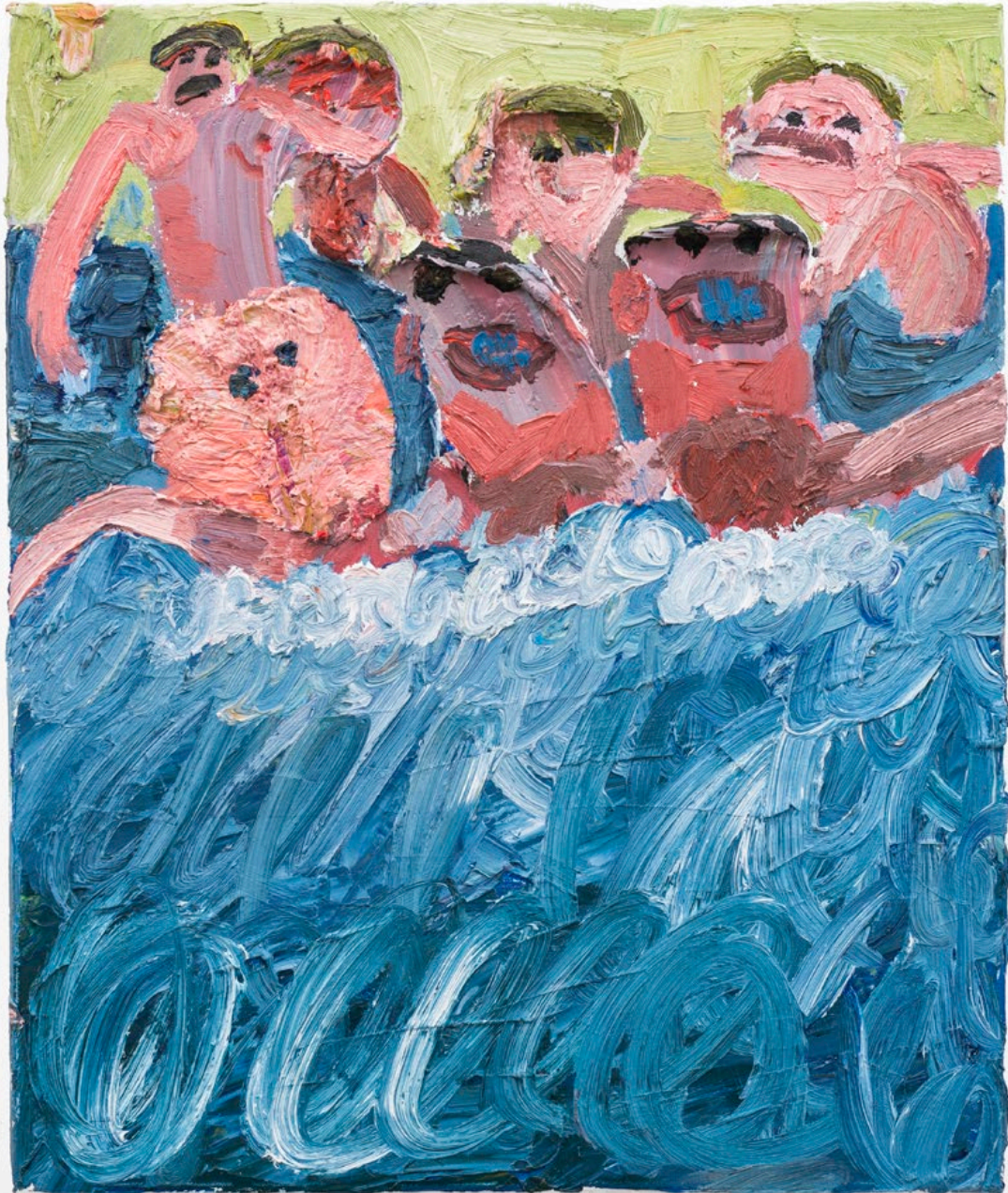
Georgina Gratrix Yobos in the Sea 2013 Oil on Canvas 60 x 50 cm