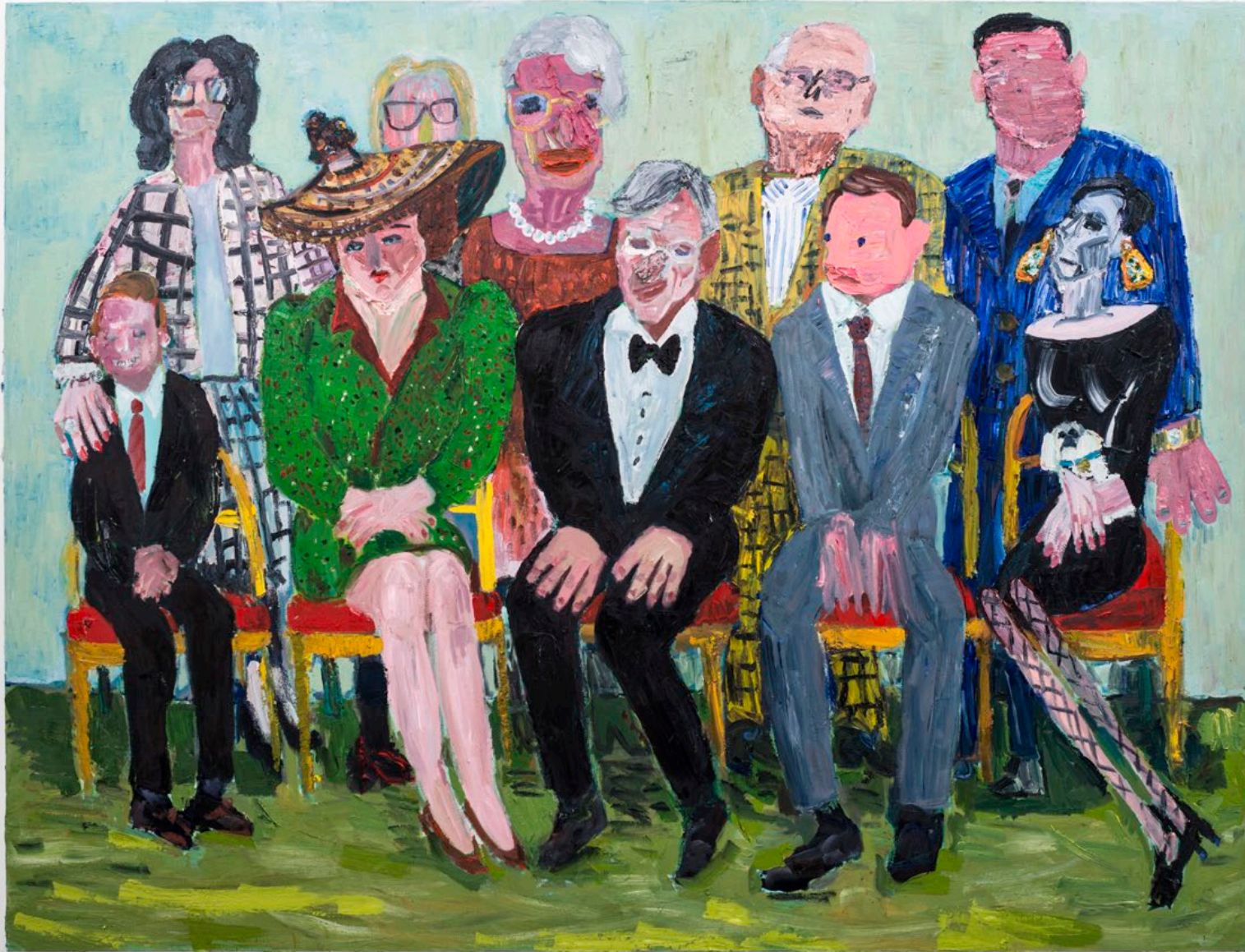
Georgina Gratrix The Appraisers 2018 Oil on Canvas 190 x 250 cm