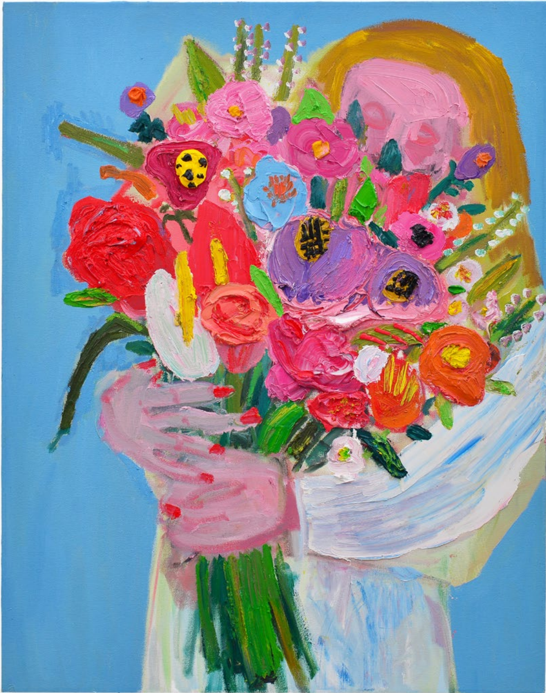
Georgina Gratrix A Woman's Right 2018 Oil on Canvas 100 x 80 cm