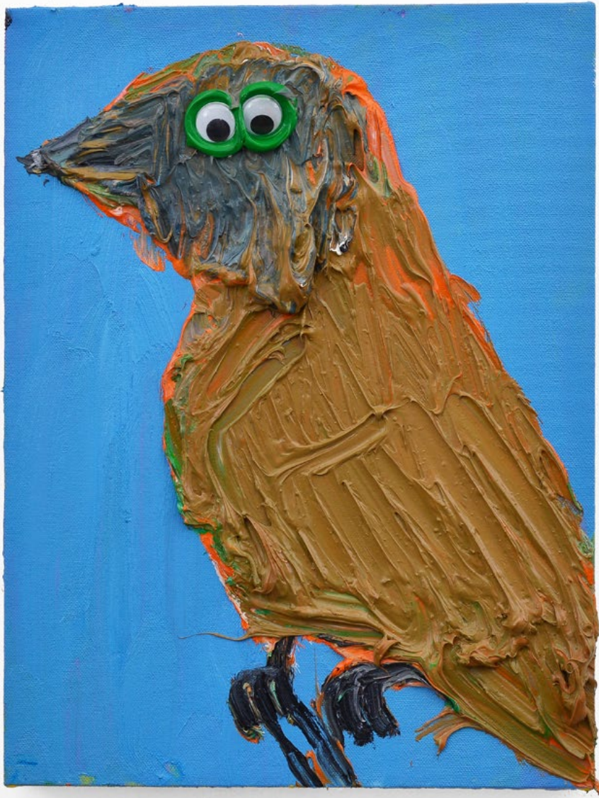
Georgina Gratrix Oopsy Bird 2018 Oil on Canvas 40 x 30 cm