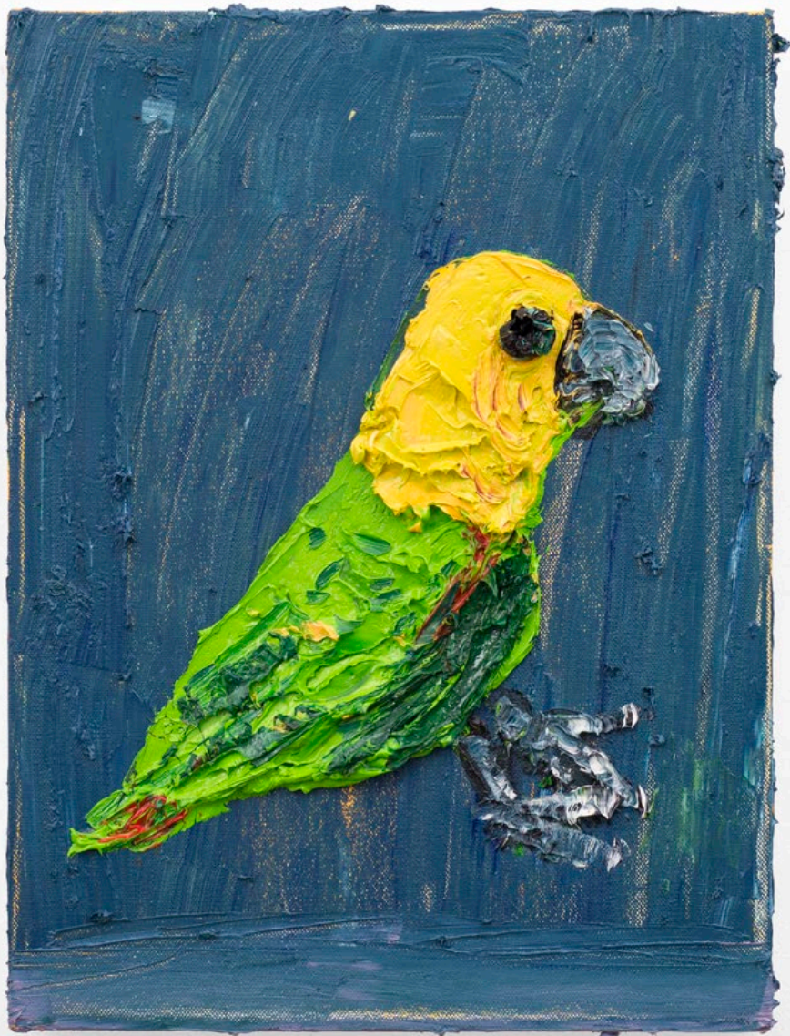
Georgina Gratrix The Green Parrot 2018 Oil on Canvas 40 x 30 cm