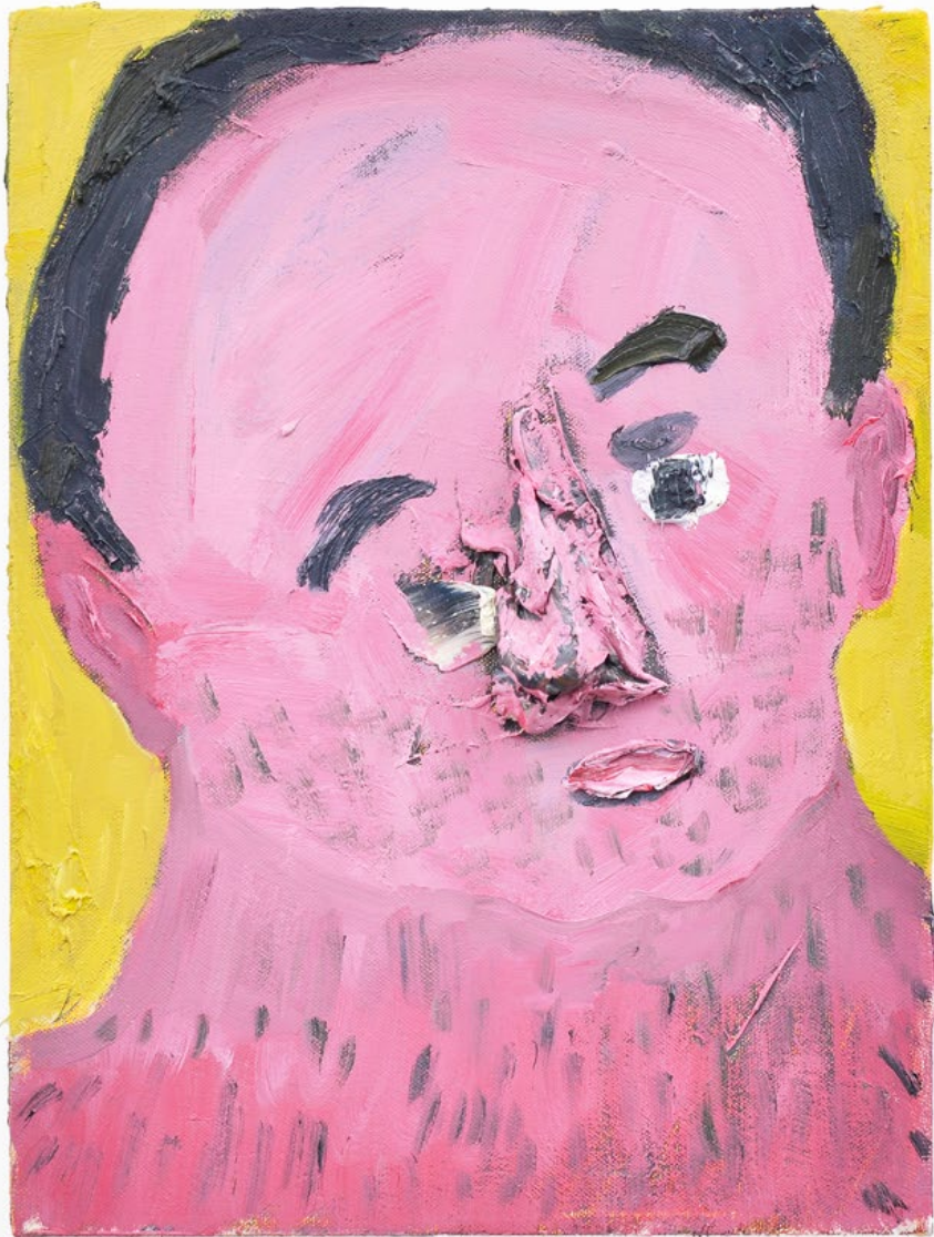
Georgina Gratrix Weekend Face 2018 Oil on Canvas 40 x 30 cm