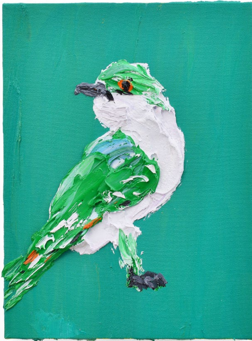
Georgina Gratrix Hugo's Bird 2018 Oil on Canvas 40 x 30 cm