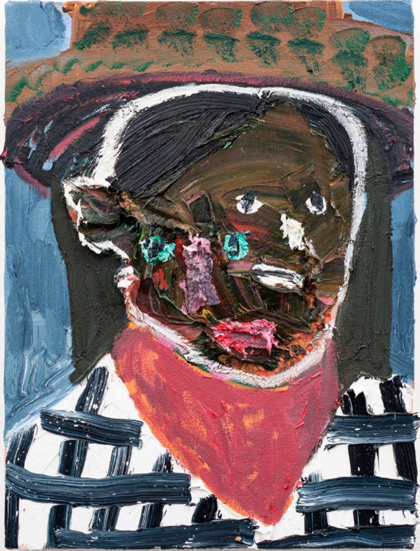
Georgina Gratrix An Enterprising Woman 2018 Oil on Canvas 40 x 30 cm