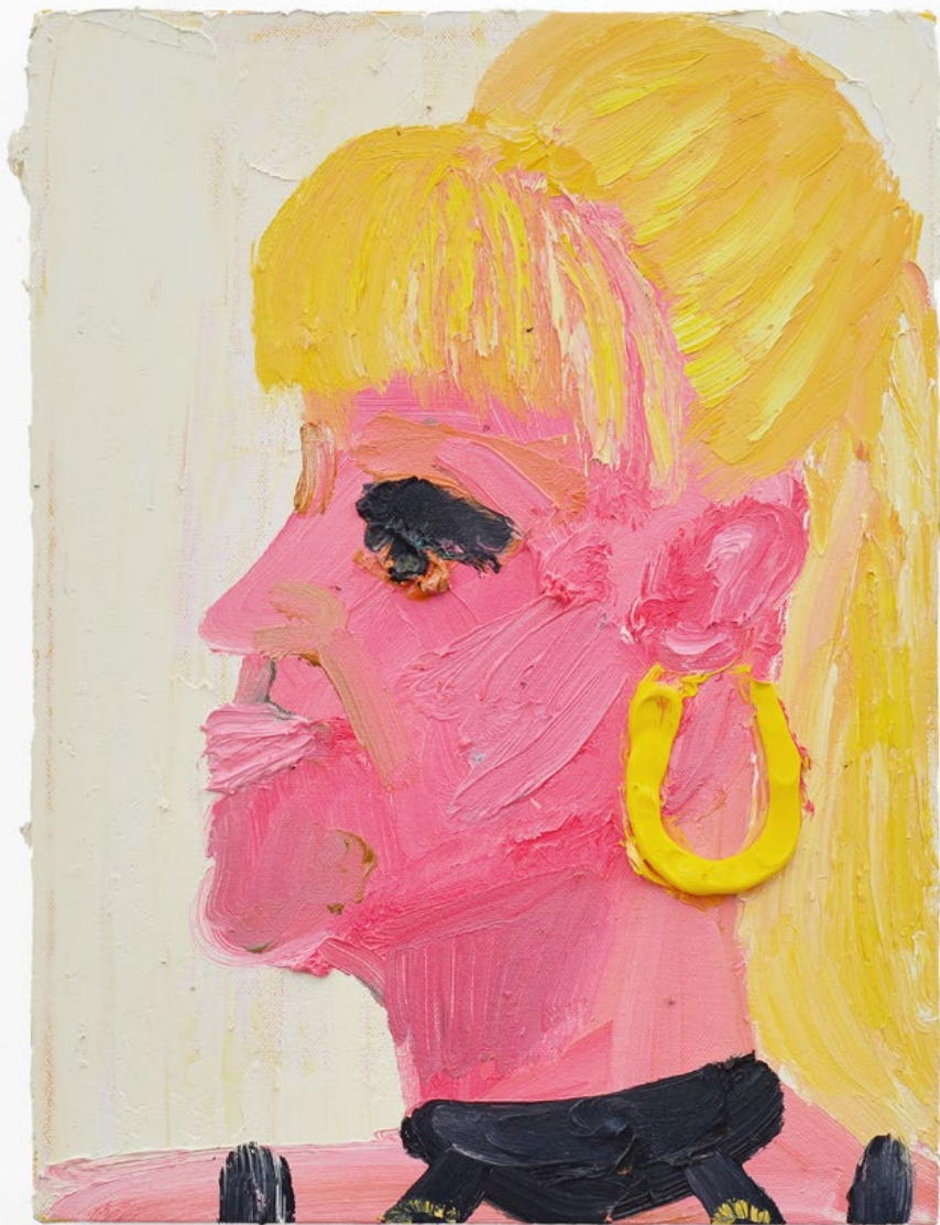
Georgina Gratrix Donatella 2018 Oil on Canvas 40 x 30 cm