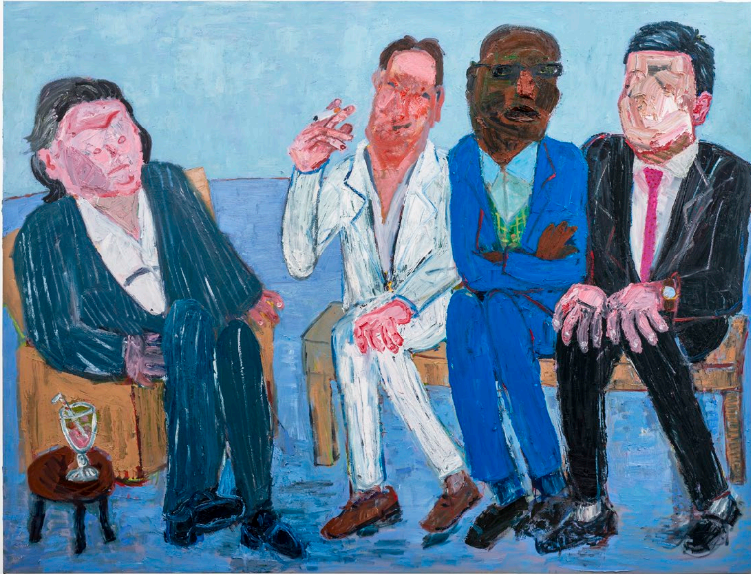
Georgina Gratrix The Milkshake Meeting 2018 Oil on Canvas 190 x 250 cm