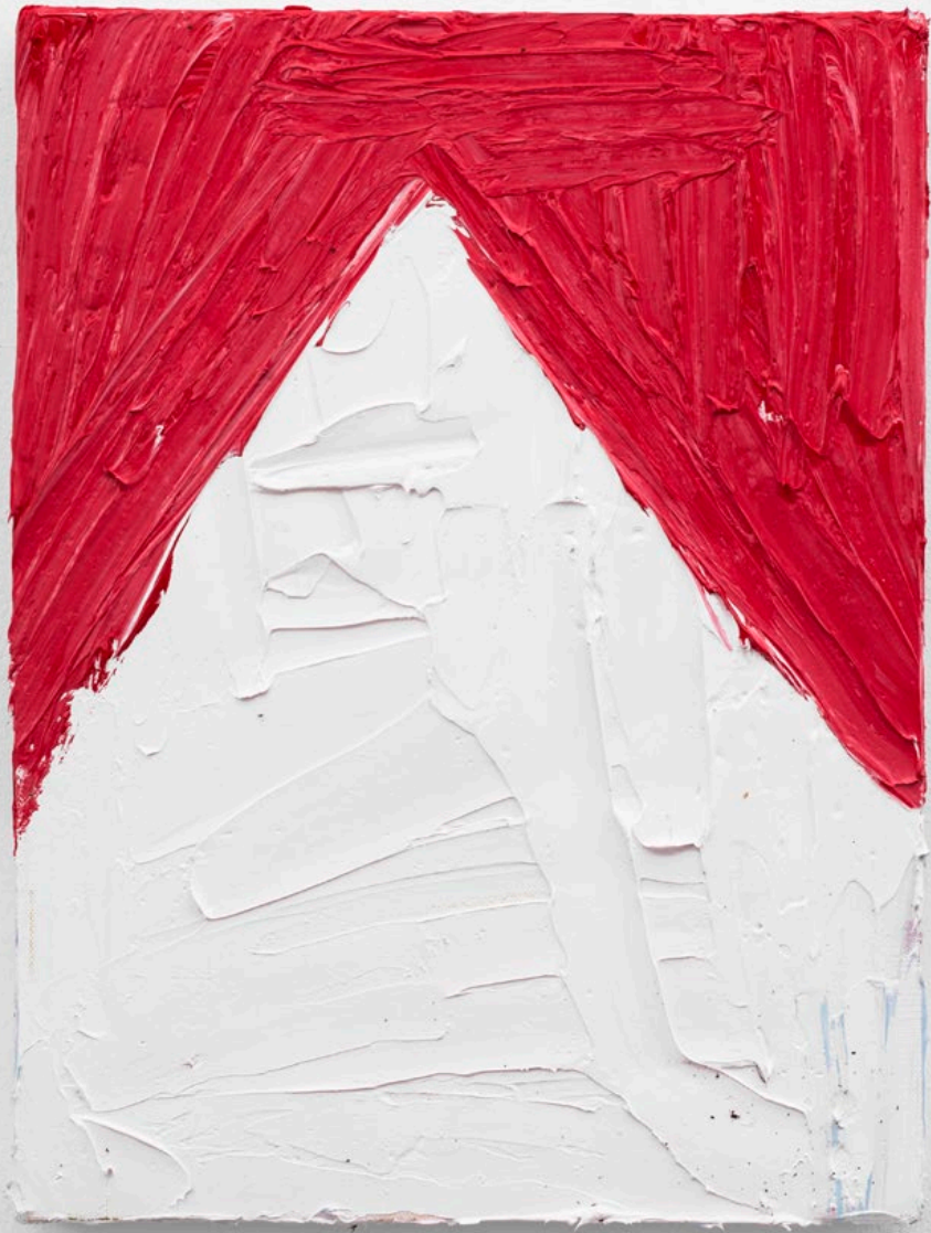
Georgina Gratrix Marlboro 2018 Oil on Canvas 40 x 30 cm