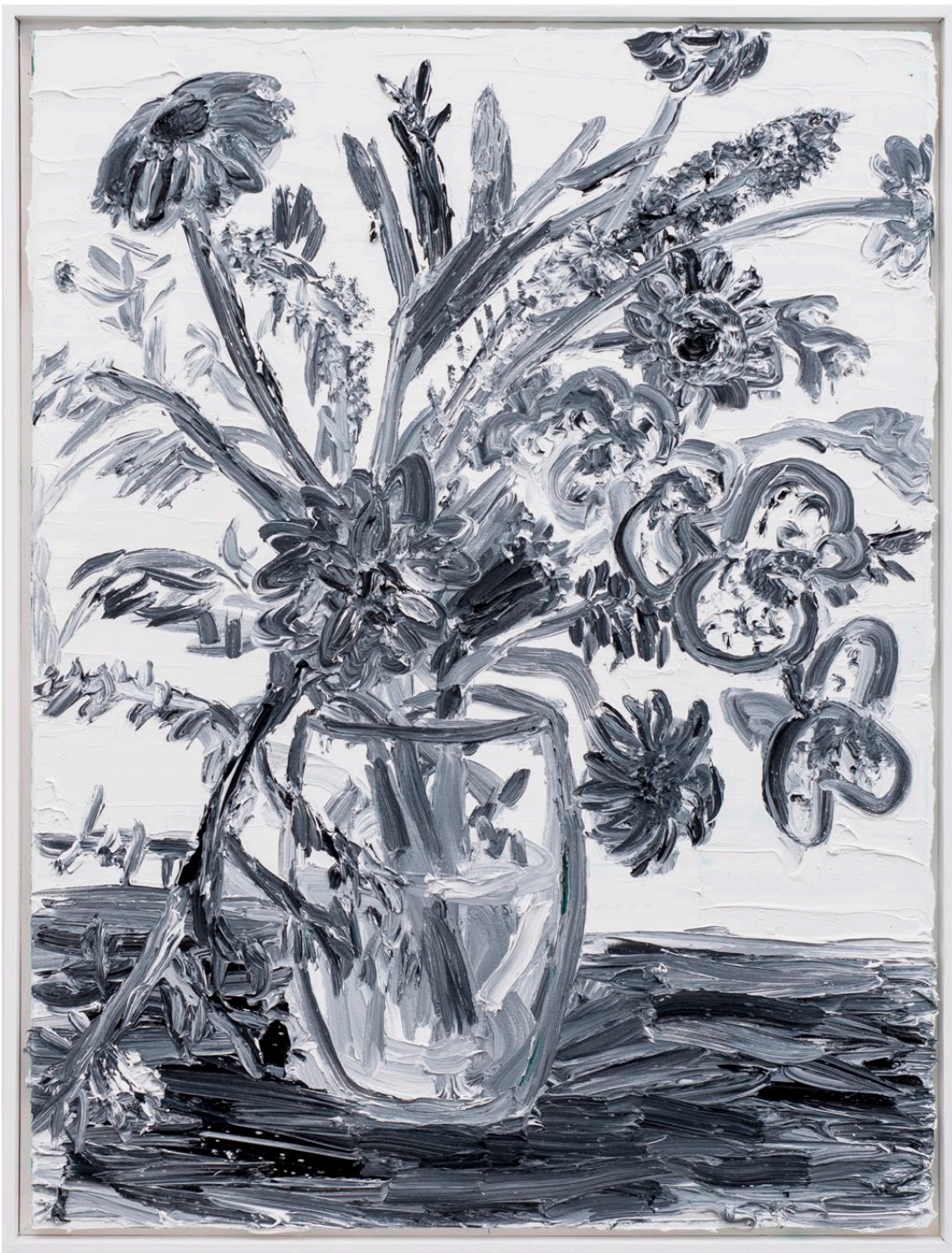
Georgina Gratrix Study in black and white 2019 Oil on Canvas 100 x 75 cm Unique