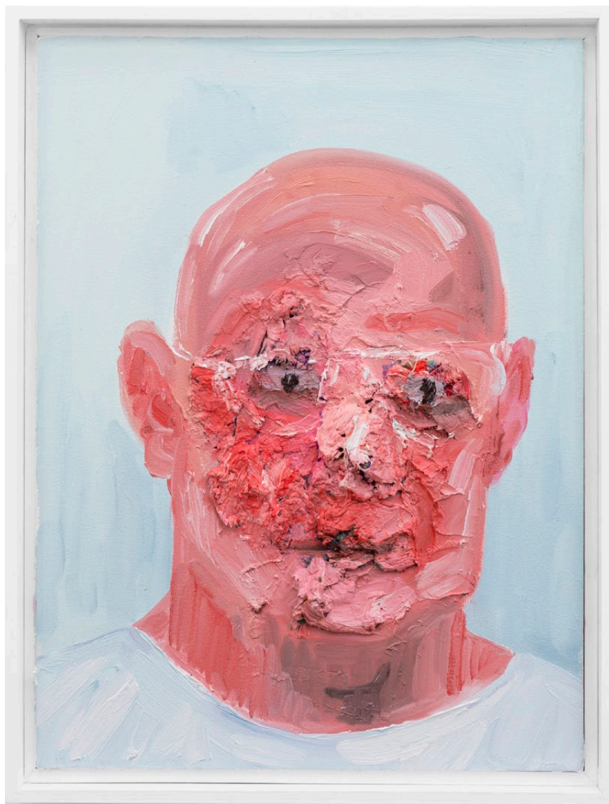
Georgina Gratrix Jon Dondon 2019 Oil on Canvas 64 x 49.5 cm Unique