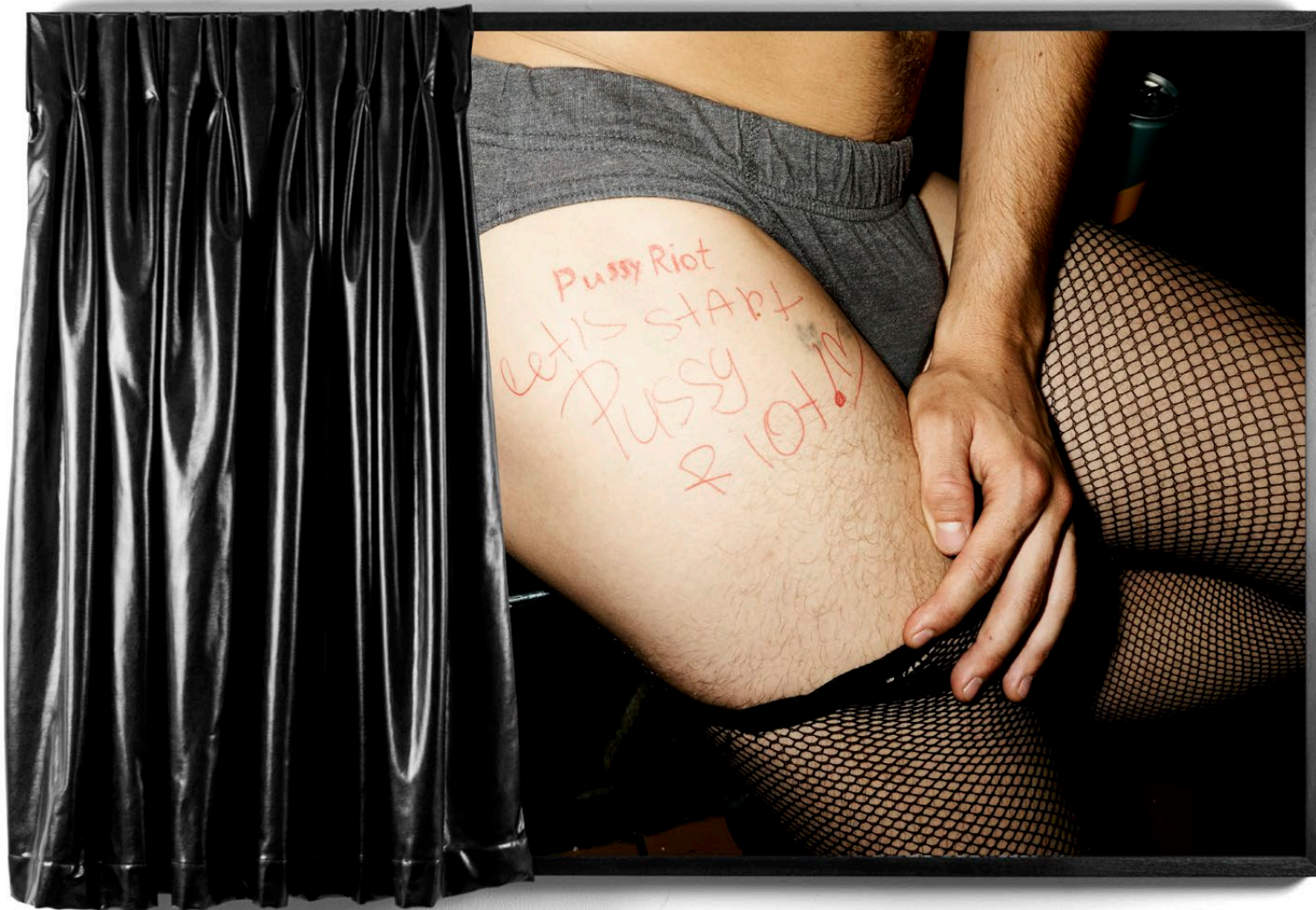
Marinella Senatore Bodies in Alliance / Politics of the Street II 2019 Lightjet Print, Diasec and Acrylic Fabric 90 x 135 cm ED 1/5 + 2AP