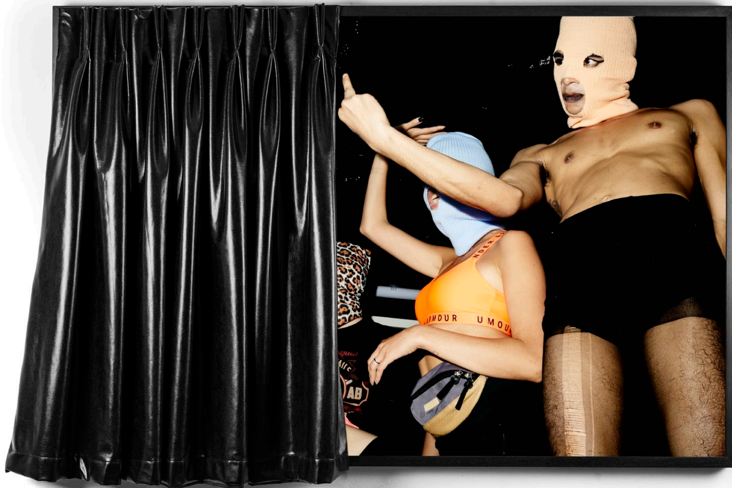
Marinella Senatore Bodies in Alliance / Politics of the Street IV 2019 Lightjet Print, Diasec and Acrylic Fabric 90 x 135 cm ED 1/5 + 2AP