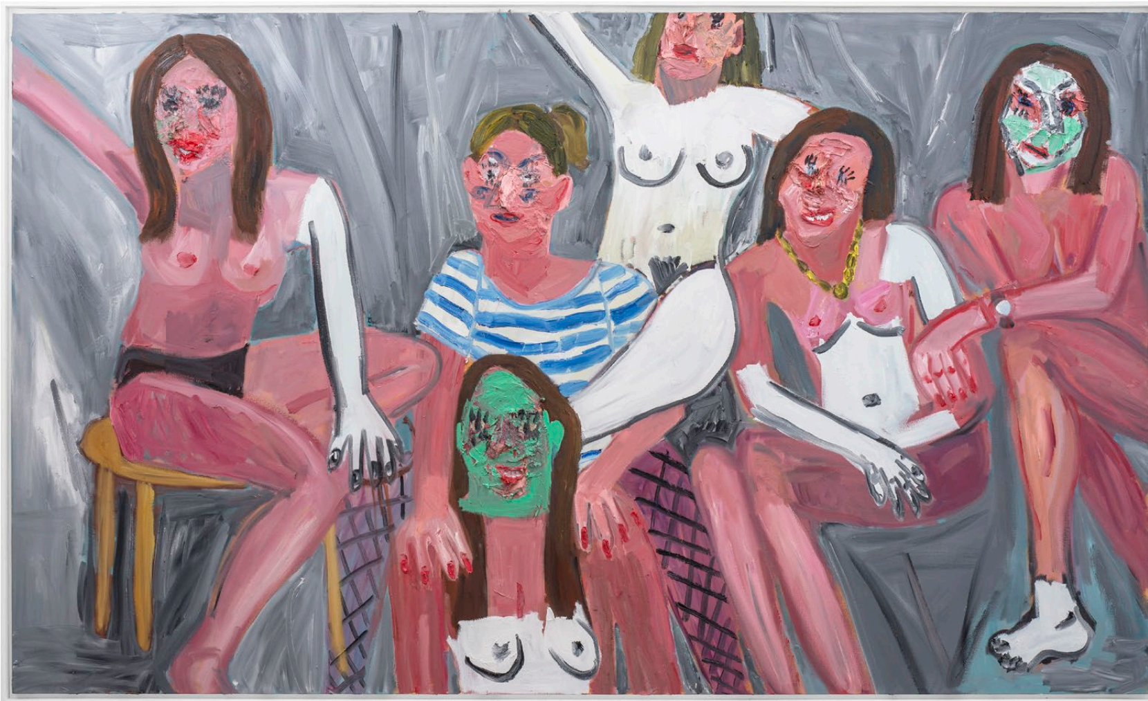
Georgina Gratrix Girls Girls Girls 2019 Oil on Canvas 154.5 x 255 cm Unique