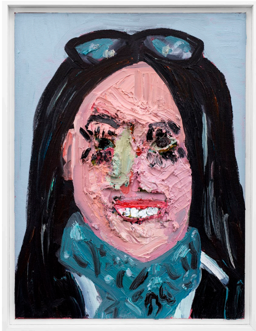
Gerogina Gratrix Liza 2019 Oil on Canvas 65 x 49.5 cm Unique