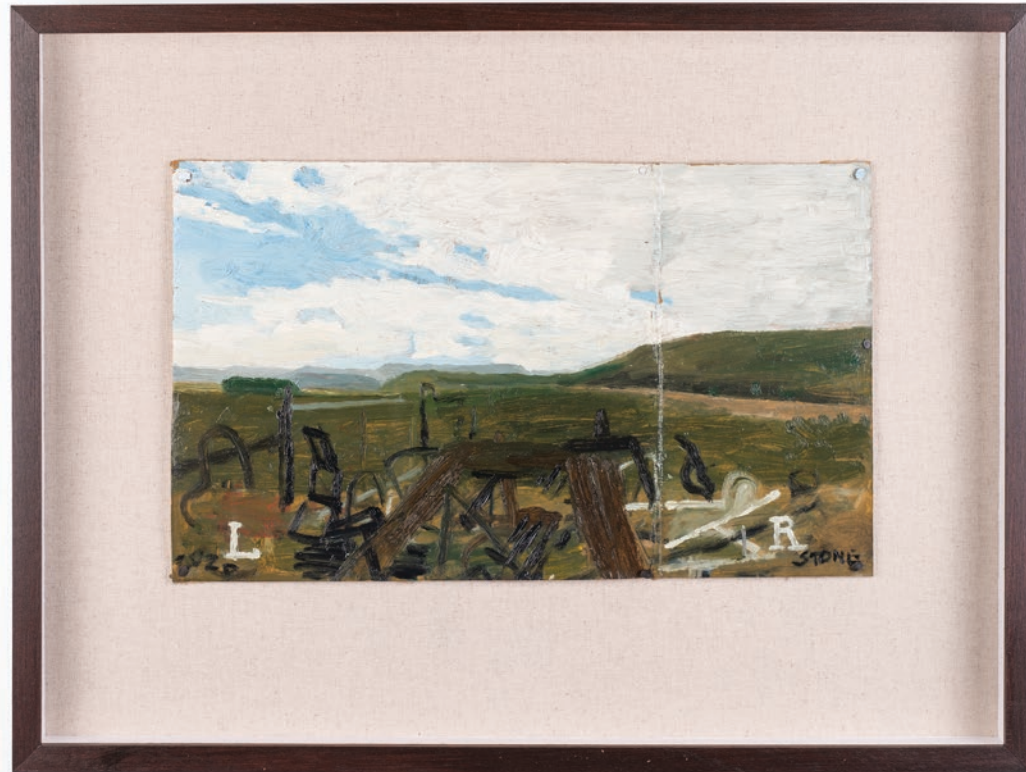
Simon Stone Aberdeen Landscape 2020 Oil on Cardboard 21 x 37 cm