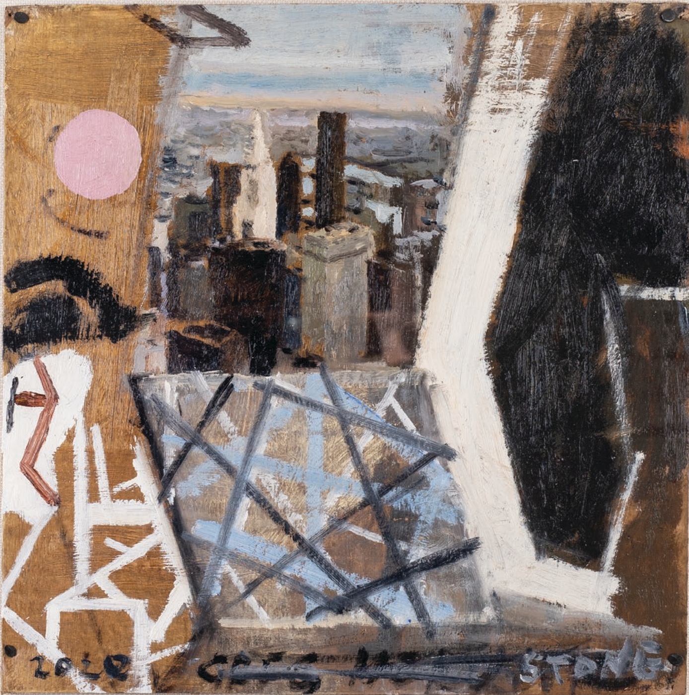
Simon Stone N.Y. (Detail) 2020 Oil on Cardboard 29 x 28.5 cm