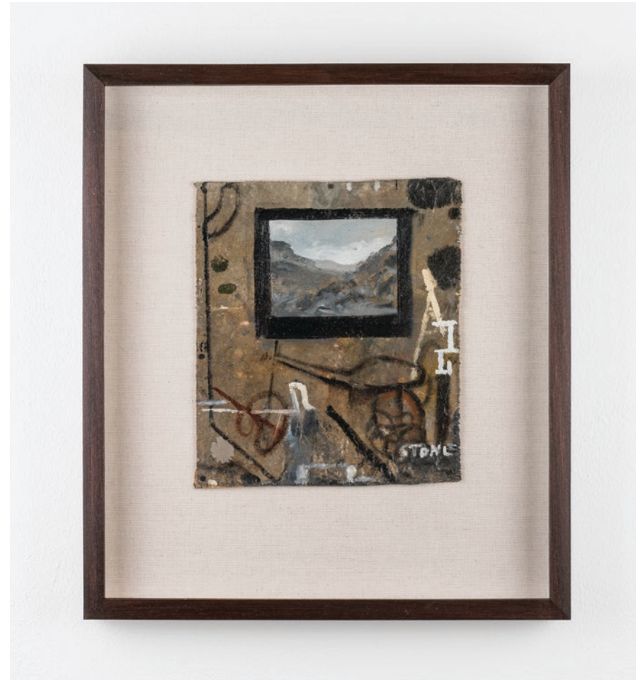
Simon Stone Grey Landscape 2020 Oil on Cardboard 33 x 20 cm