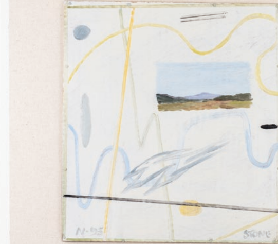
Simon Stone Floating Landscape 2020 Oil on Cardboard 31 x 28 cm