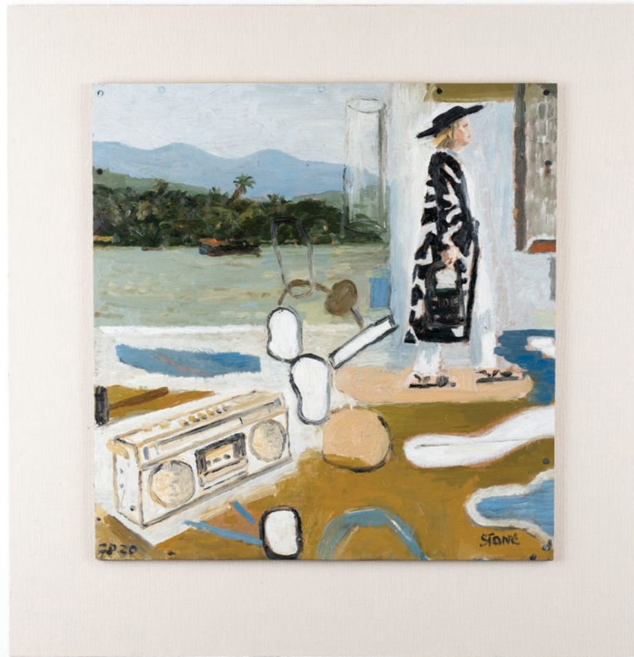
Simon Stone Holiday 2020 Oil on Cardboard 34 x 33 cm