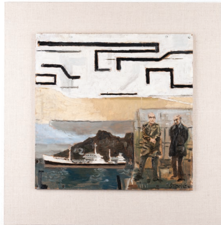
Simon Stone Two Men + a Ship 2020 Oil on Cardboard 31 x 32 cm