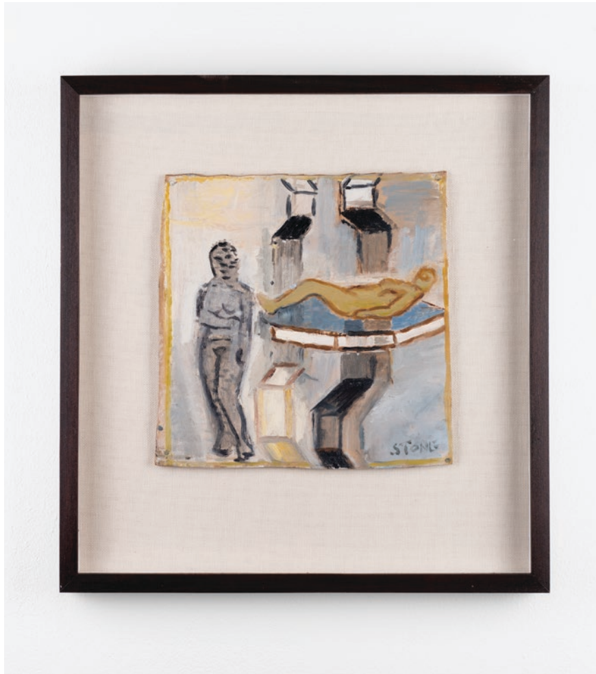
Simon Stone Nude Suspended 2020 Oil on Cardboard 25 x 25 cm