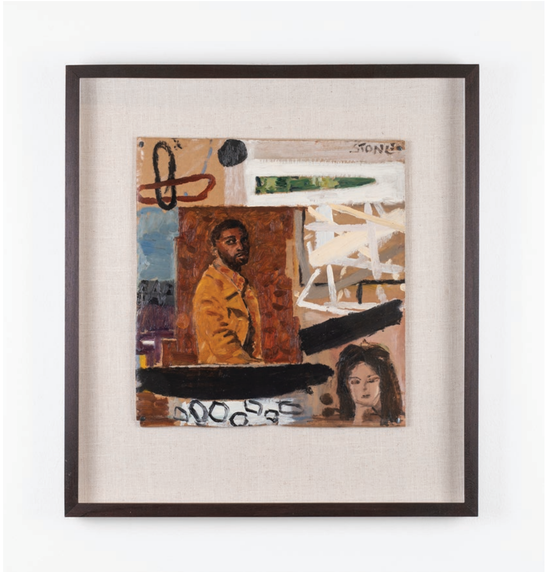
Simon Stone The Rap 2020 Oil on Cardboard 33 x 31 cm