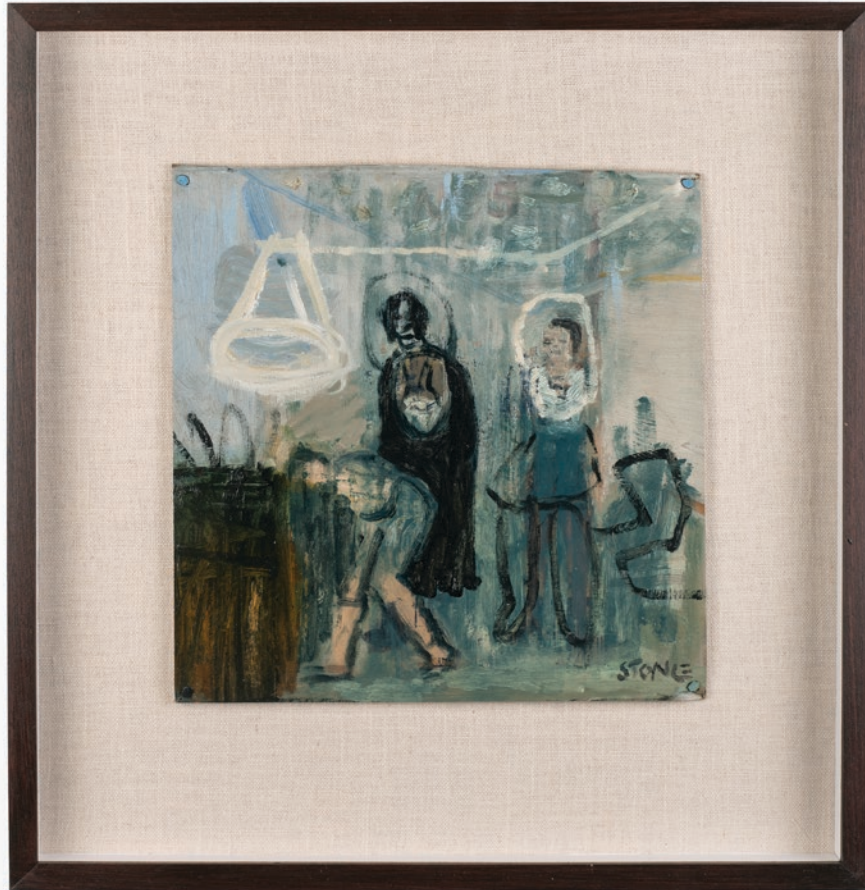
Simon Stone In the Air 2020 Oil on Cardboard 28 x 28 cm