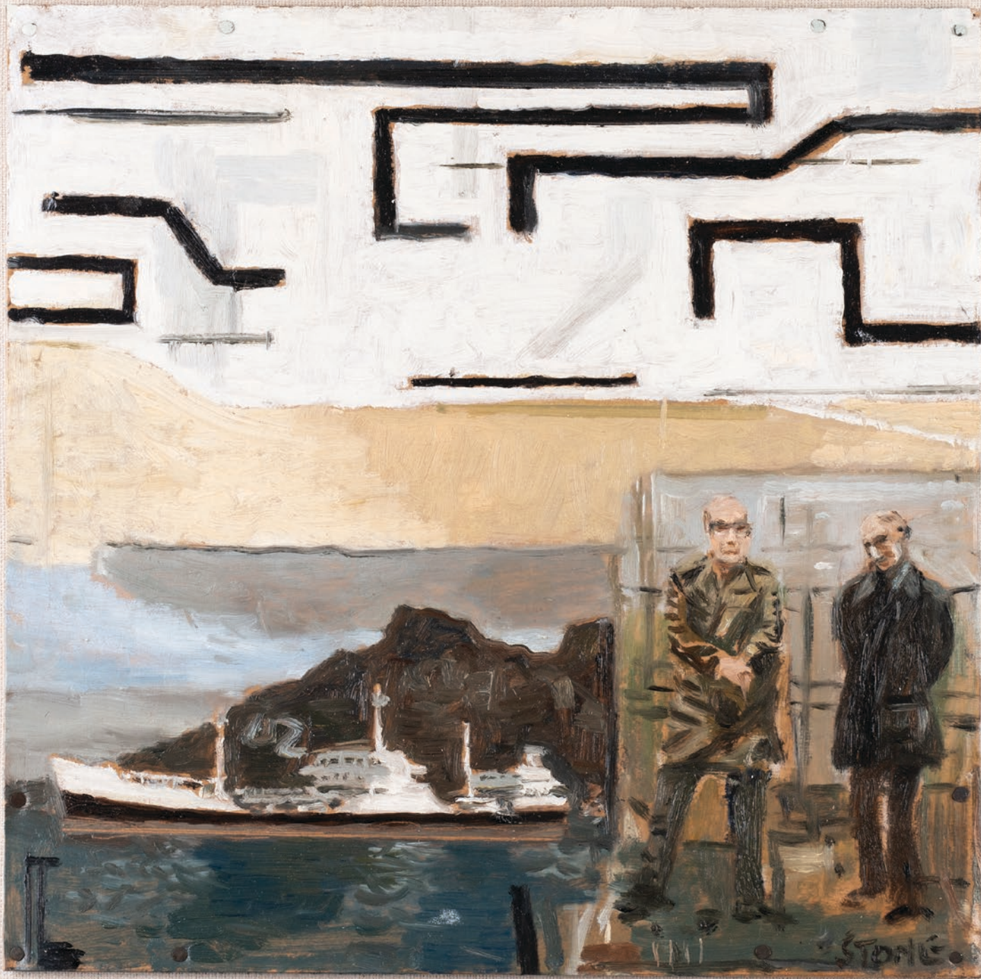
Simon Stone Two Men + a Ship (Detail) 2020 Oil on Cardboard 31 x 32 cm