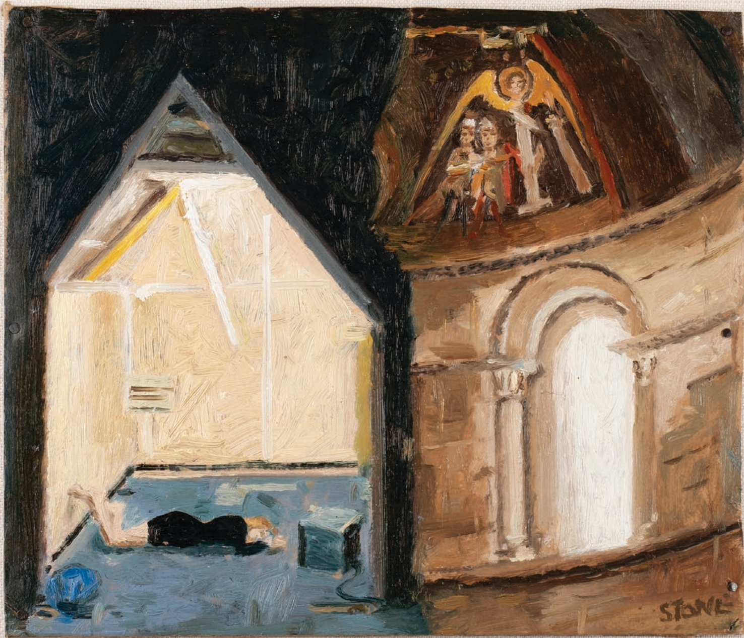
Simon Stone Refuge (Detail) 2020 Oil on Cardboard 24.5 x 28.5 cm