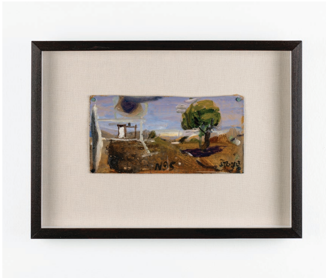
Simon Stone Landscape with Tree 2020 Oil on Cardboard 12 x 22 cm