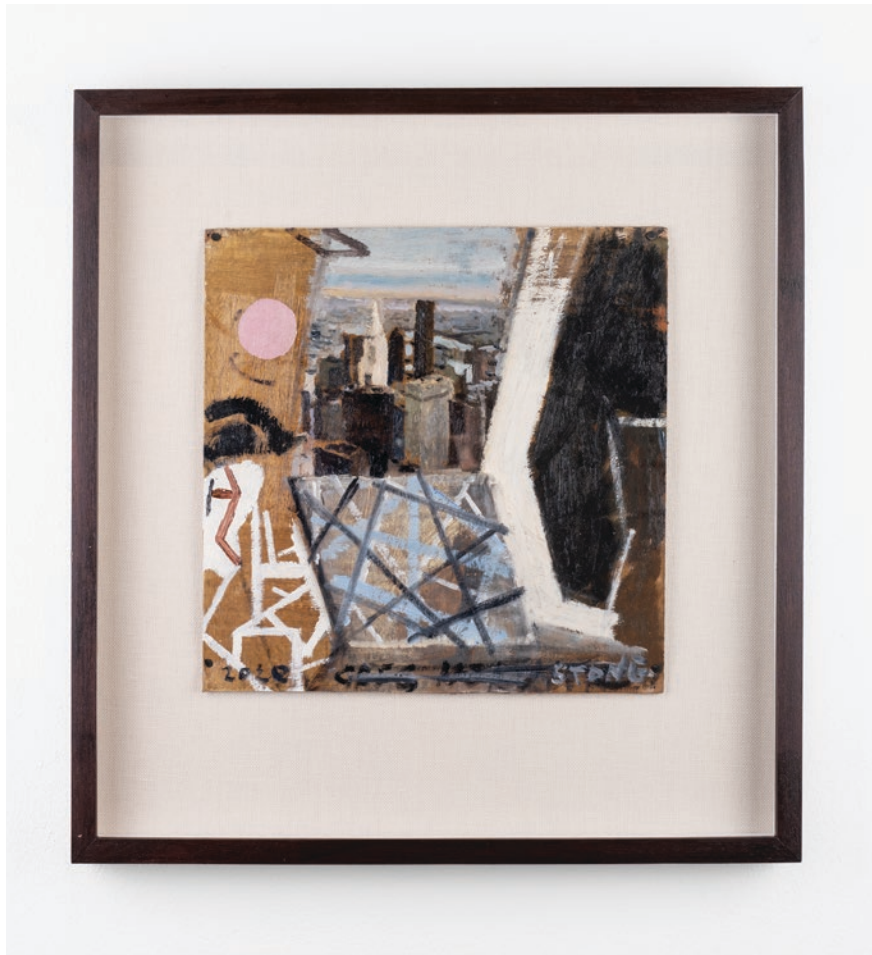
Simon Stone N.Y. 2020 Oil on Cardboard 29 x 28.5 cm