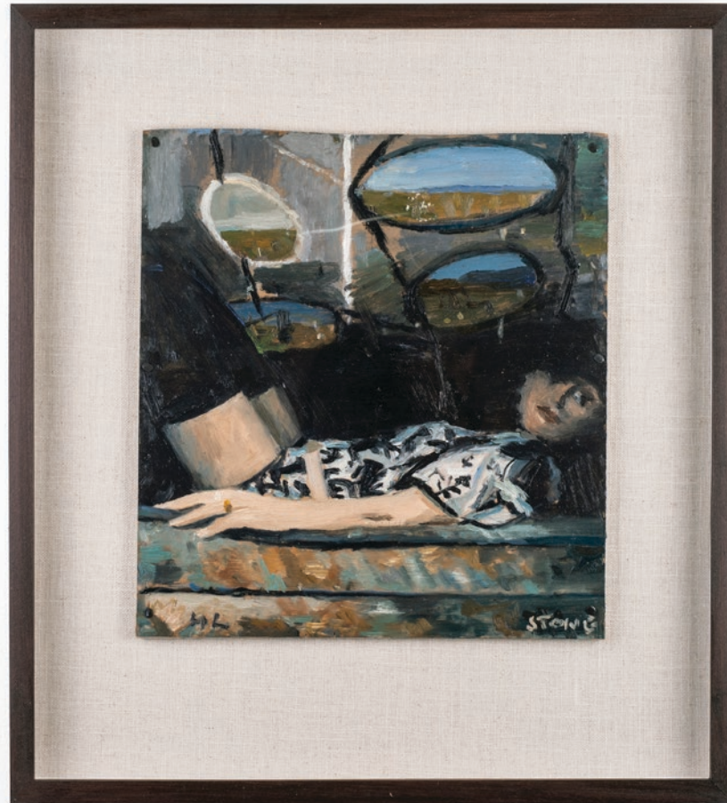
Simon Stone Floral Top 2020 Oil on Cardboard 32 x 29.5 cm