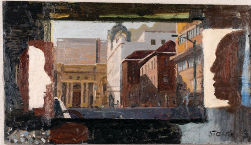
Simon Stone Die Hoff 2020 Oil on Cardboard 23 x 39.5 cm