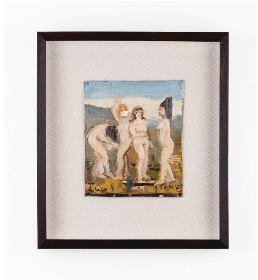
Simon Stone 4 W 2020 Oil on Cardboard 20 x 16.5 cm