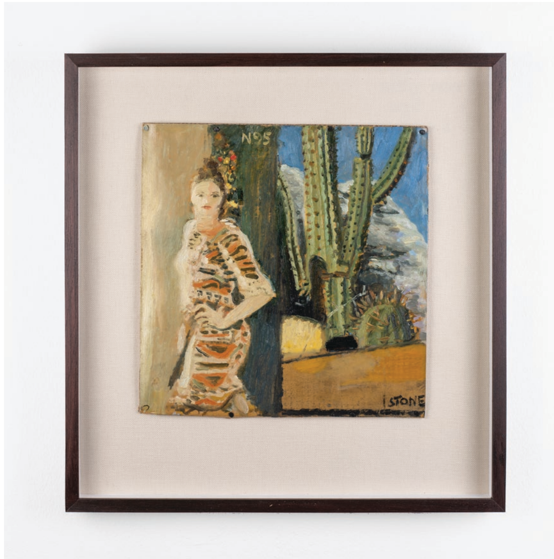
Simon Stone Cactus 2020 Oil on Cardboard 32 x 32 cm