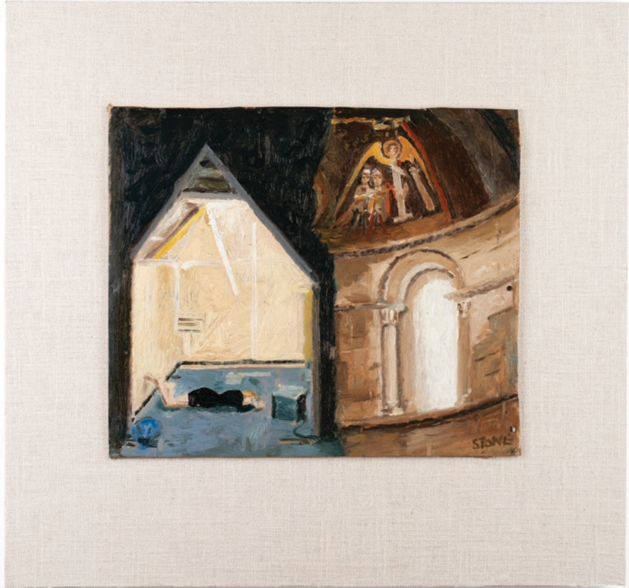
Simon Stone Refuge 2020 Oil on Cardboard 24.5 x 28.5 cm