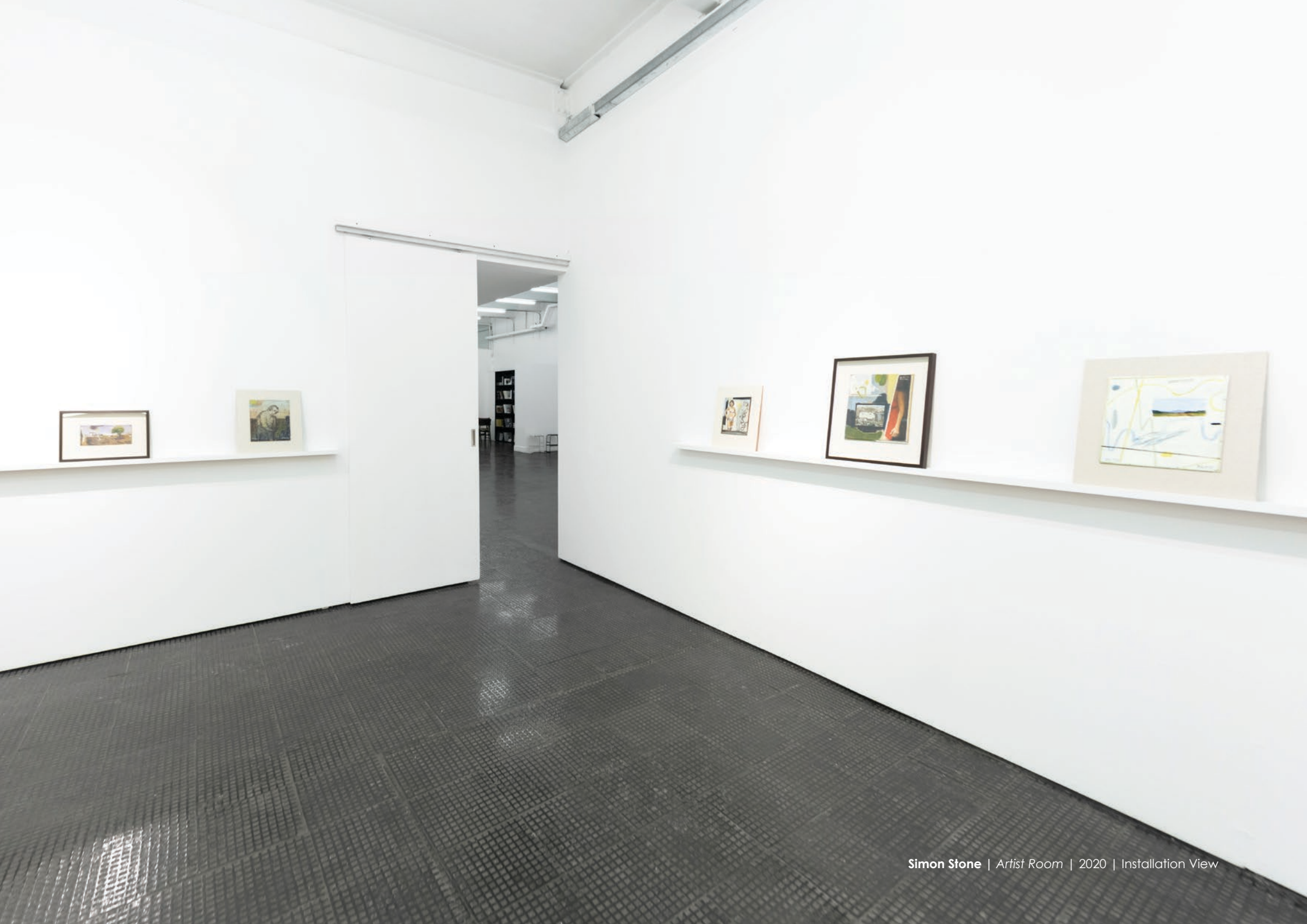
Simon Stone | Artist Room | 2020 | Installation View