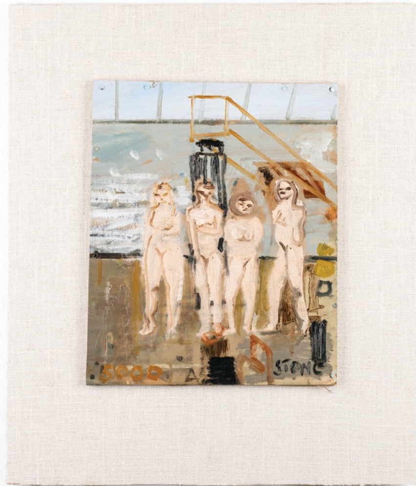
Simon Stone Four Nudes in Studio 2020 Oil on Cardboard 25 x 21 cm