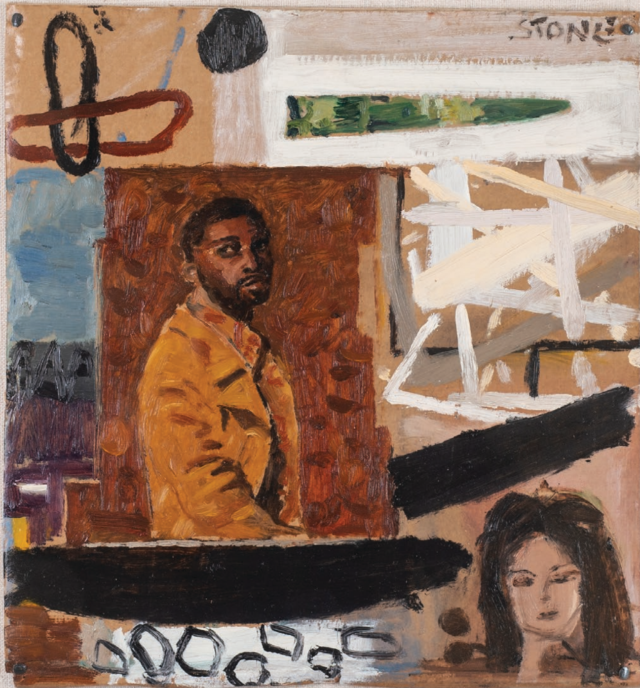
Simon Stone The Rap (Detail) 2020 Oil on Cardboard 33 x 31 cm