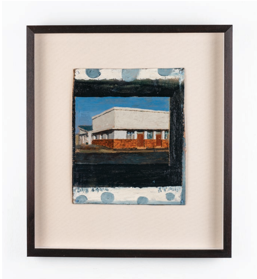
Simon Stone Aberdeen Bank 2020 Oil on Cardboard 25 x 21 cm