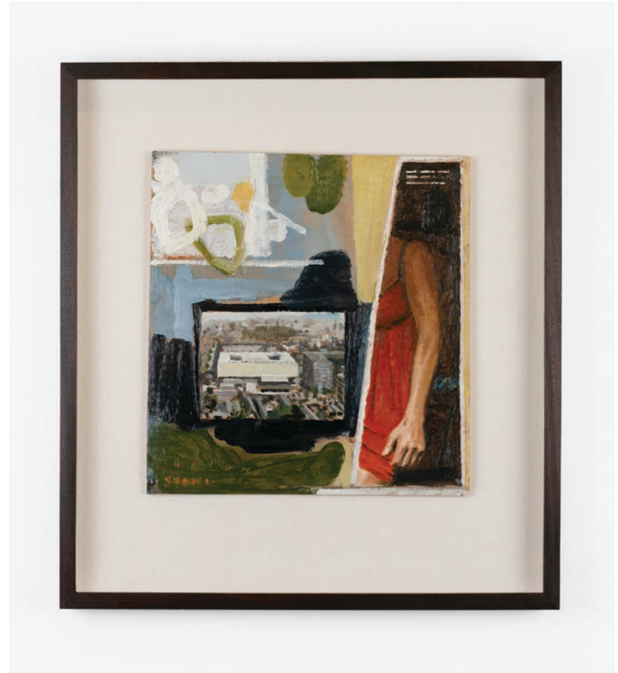
Simon Stone Arm 2020 Oil on Cardboard 32.5 x 30.5 cm