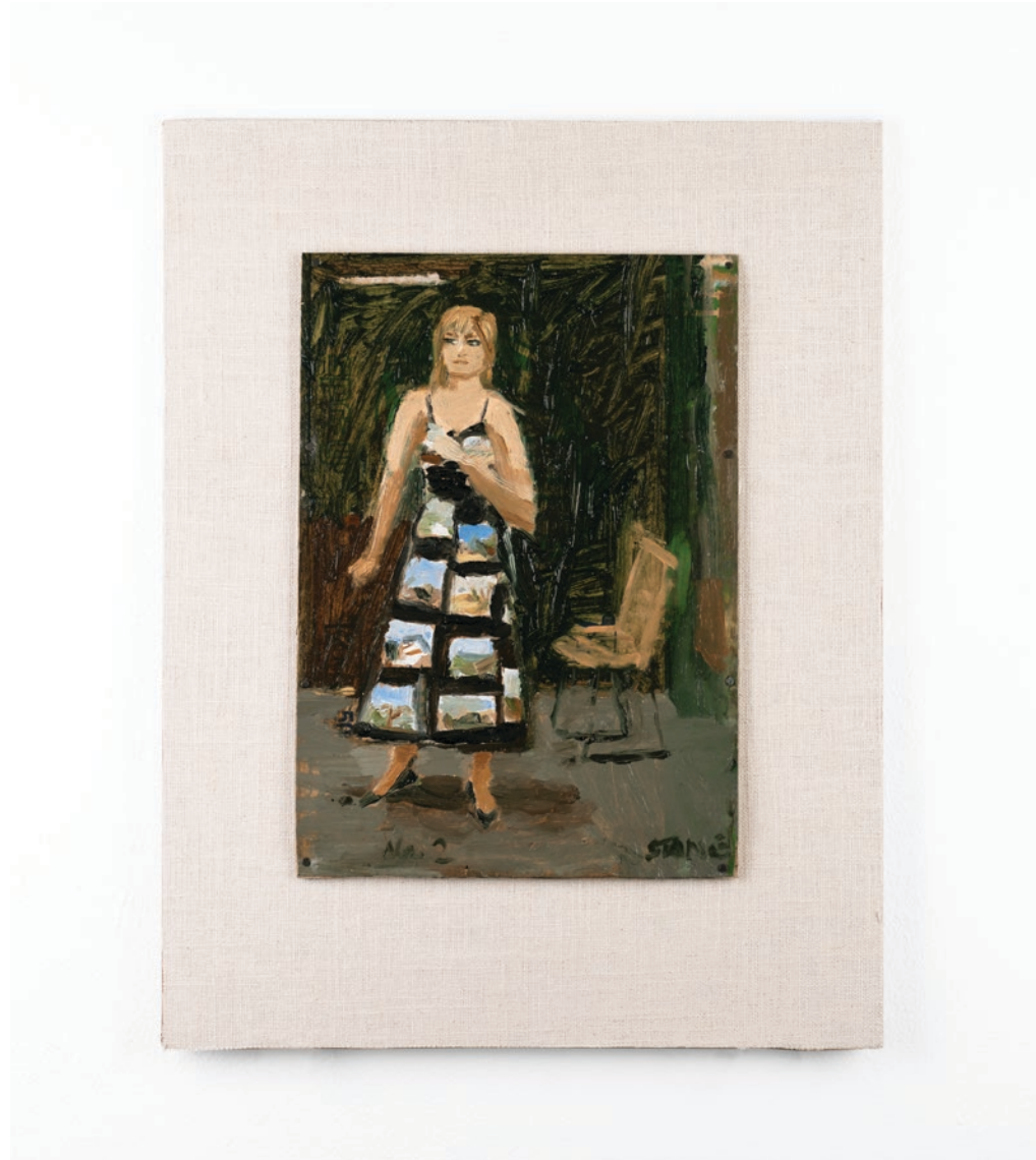
Simon Stone Landscape Dress 2020 Oil on Cardboard 30 x 21 cm