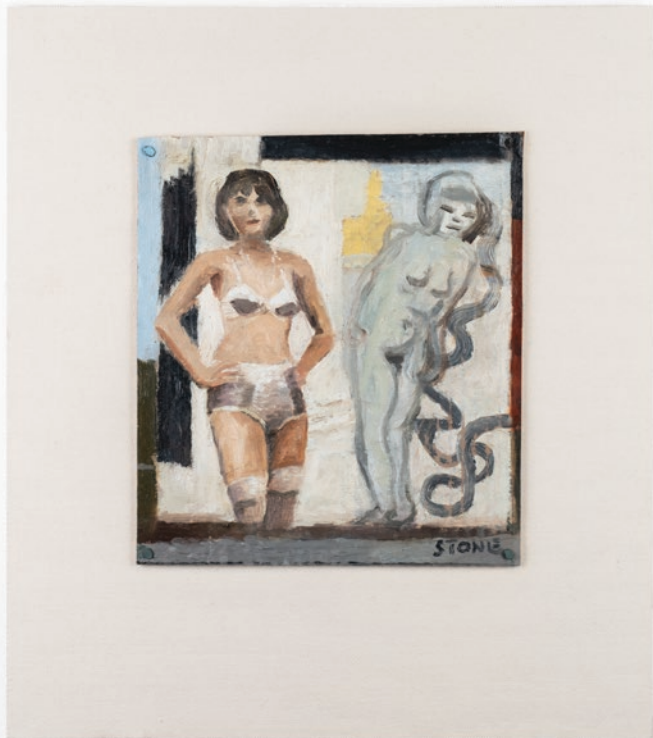
Simon Stone Arms Akimbo 2020 Oil on Cardboard 23 x 20 cm