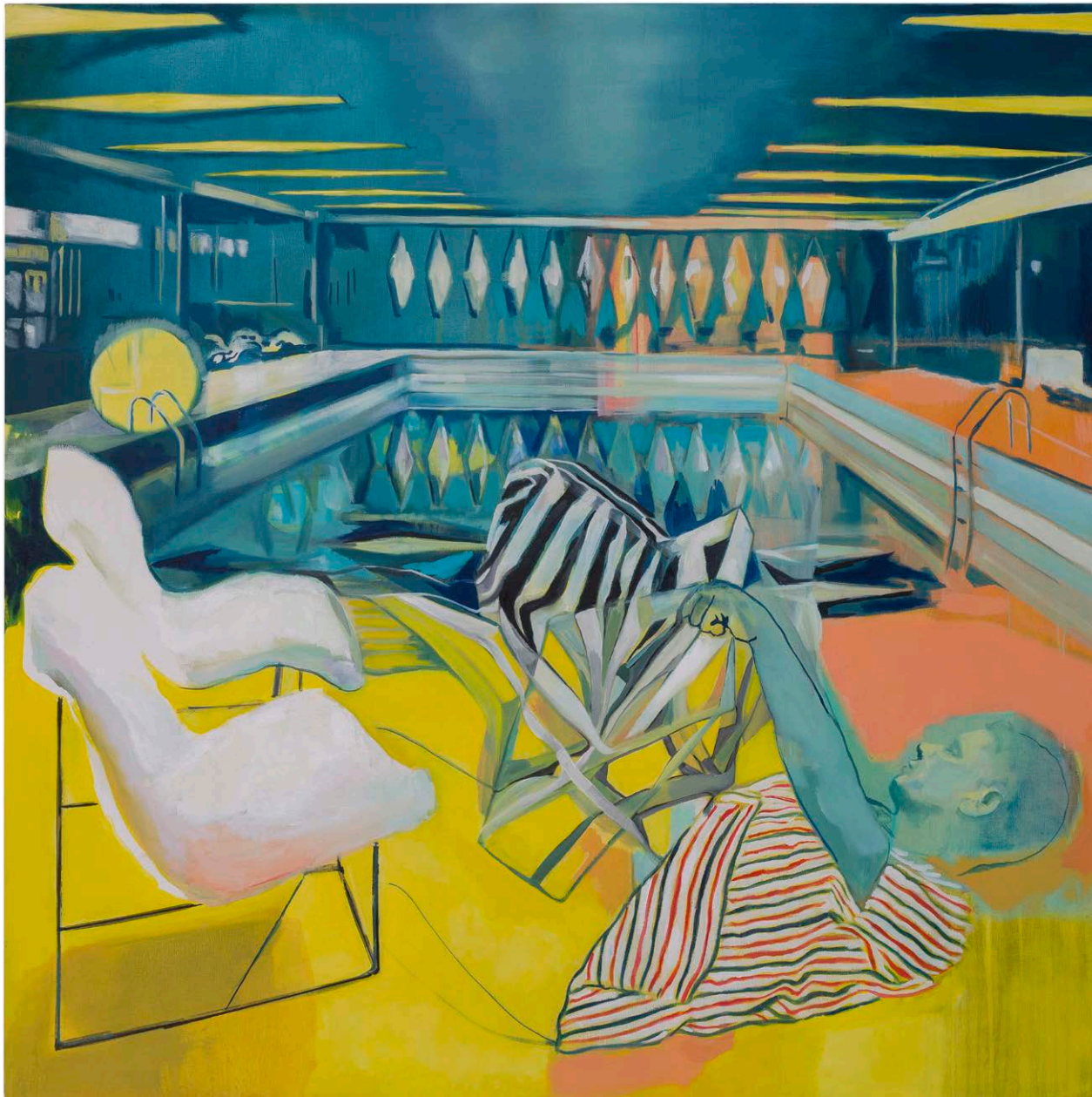
Kate Gottgens The Abstractor 2018 Oil on Canvas 150 x 150 cm