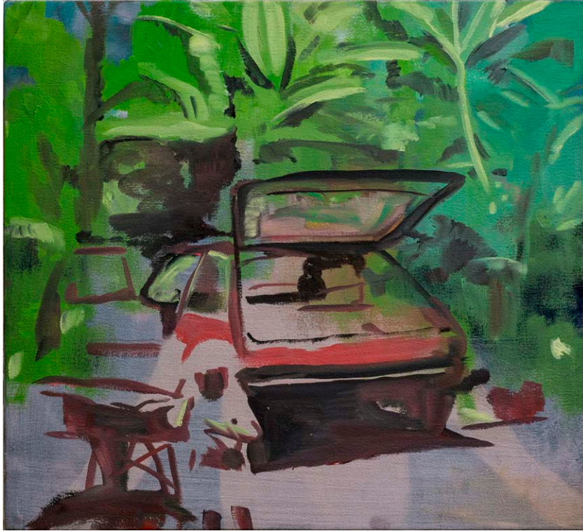
Kate Gottgens Are we there? 2018 Oil on Canvas 50 x 51 cm