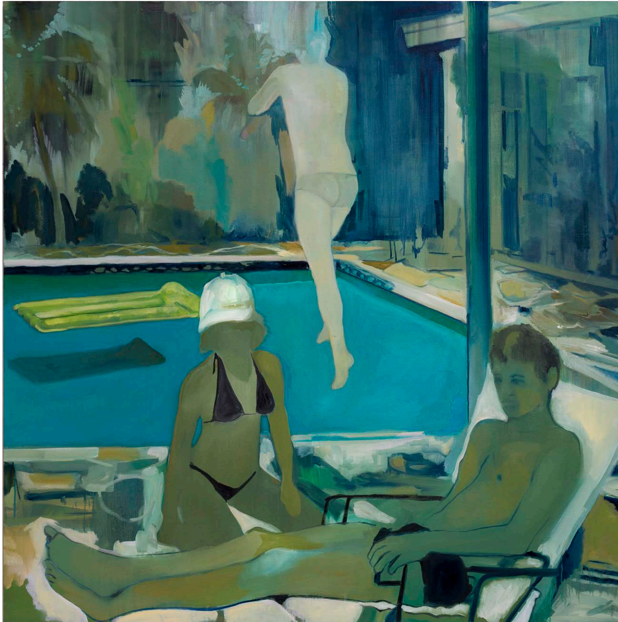
Kate Gottgens Hypnotics 2018 Oil on Canvas 150 x 150 cm