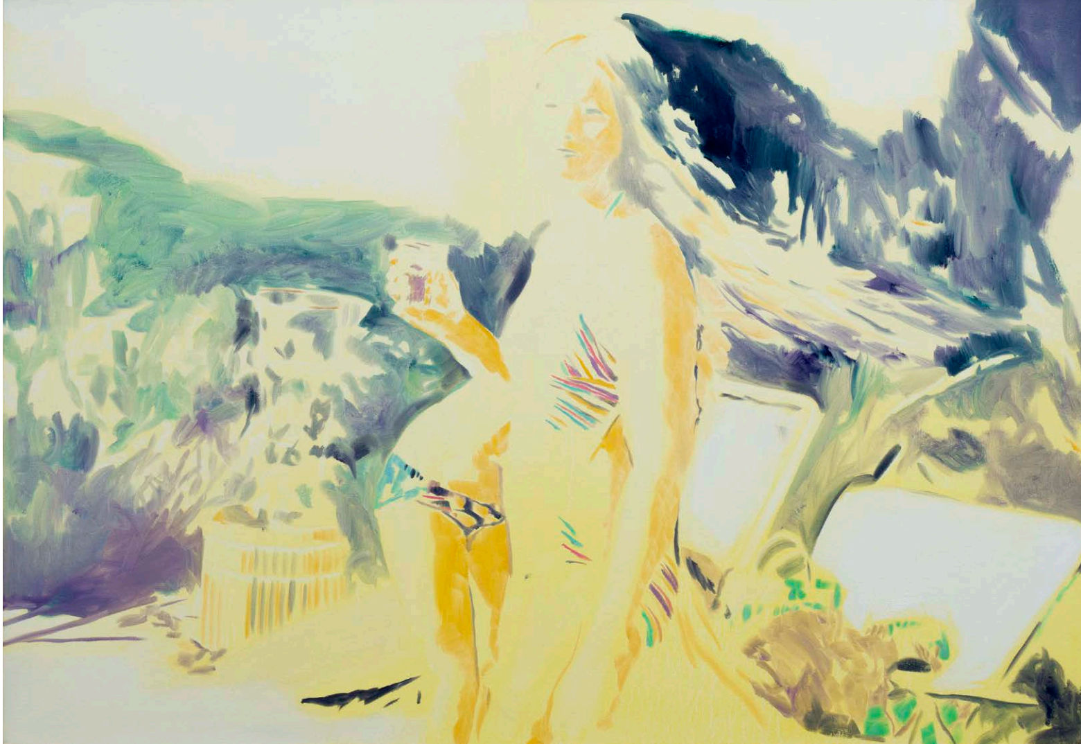
Kate Gottgens The Heiress 2018 Oil on Canvas 90 x 130 cm