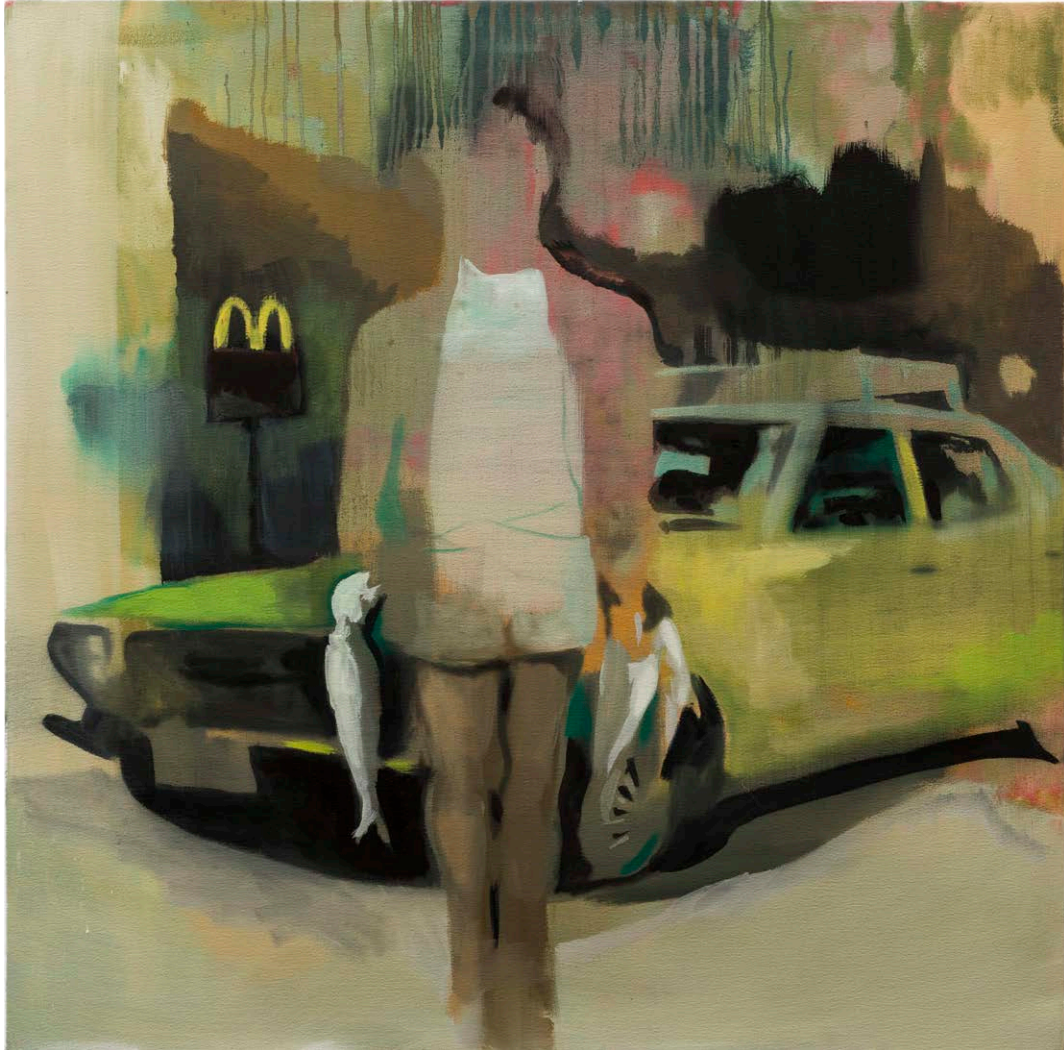
Kate Gottgens Silvers 2018 Oil on Canvas 95 x 96 cm