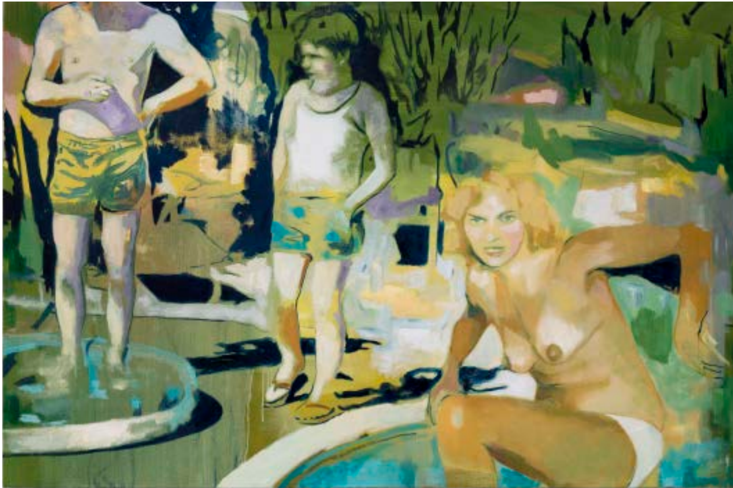
Kate Gottgens Cul de Sac 2018 Oil on Canvas 111 x 165 cm