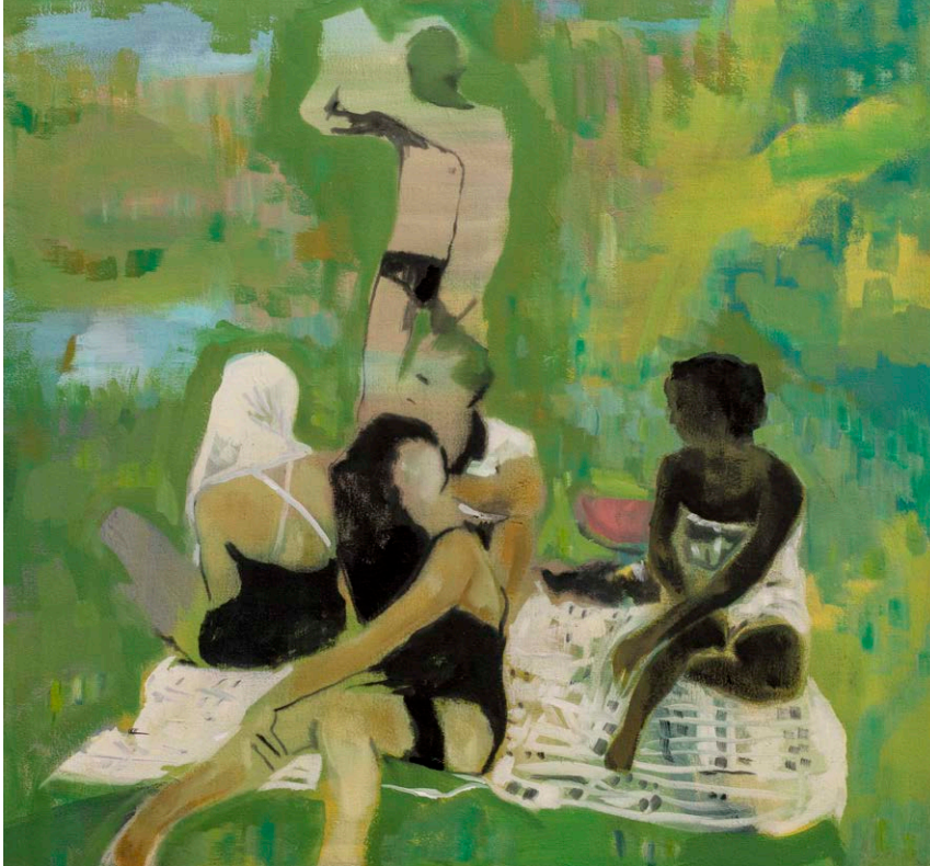
Kate Gottgens Picnic 2018 Oil on Canvas 76 x 75 cm