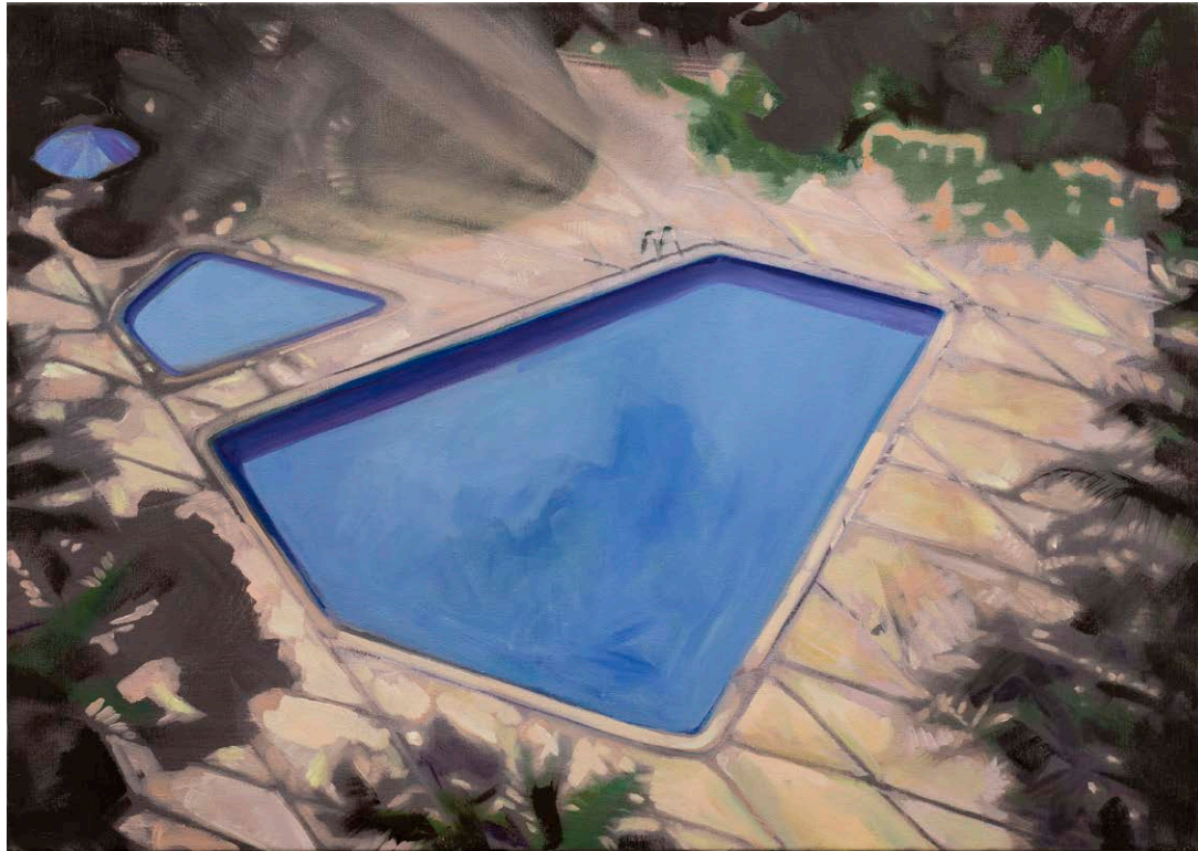
Kate Gottgens Bird's Eye View 2018 Oil on Canvas 69 x 90 cm