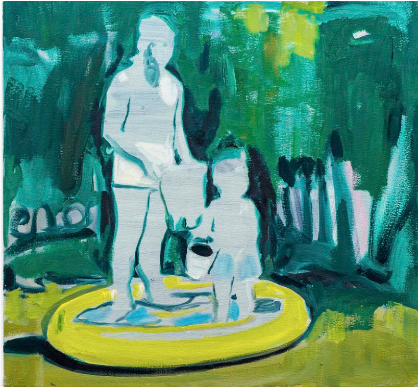
Kate Gottgens Paddling Pool 2018 Oil on Canvas 50 x 51 cm